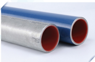
แบบสำหรับน้ำร้อน (ไส้สีแดง-Type H) Class M (Medium)